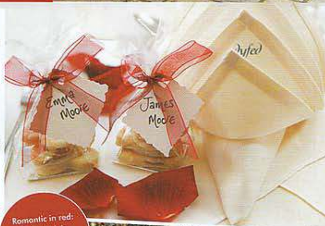
Romantic in red: The couple's colour scheme was present in all the little details

"After New York came the bright lights of Las Vegas," she continues. "The whole place is so vibrant with its amazing hotels and casinos. We also visited the Grand Canyon which was phenomenal – I'd recommend it to everyone."