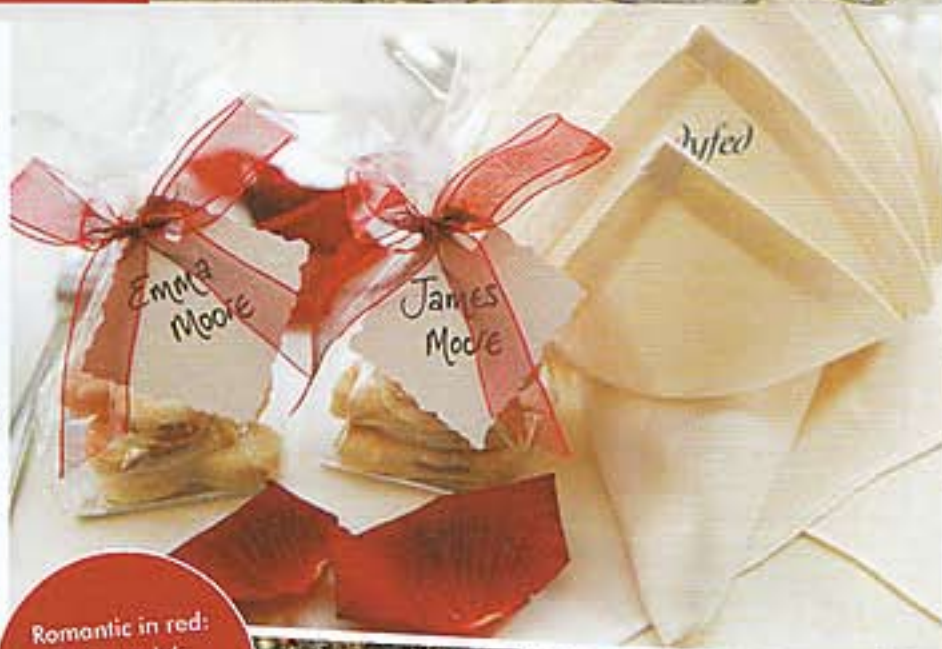
Romantic in red: The couple's colour scheme was present in all the little details

"After New York came the bright lights of Las Vegas," she continues. "The whole place is so vibrant with its amazing hotels and casinos. We also visited the Grand Canyon which was phenomenal – I'd recommend it to everyone."